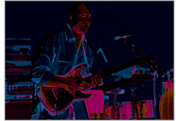
The Associated Press