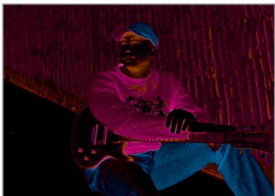
Bernie Williams comes to Westhampton on July 14

Signed by the Yankees when he was 17 years old, Williams spent 16 years with the Bronx Bombers, as he worked his way into the hearts of the Yankee faithful. He built his reputation on the diamond and is constantly named amongst legends like Babe Ruth,